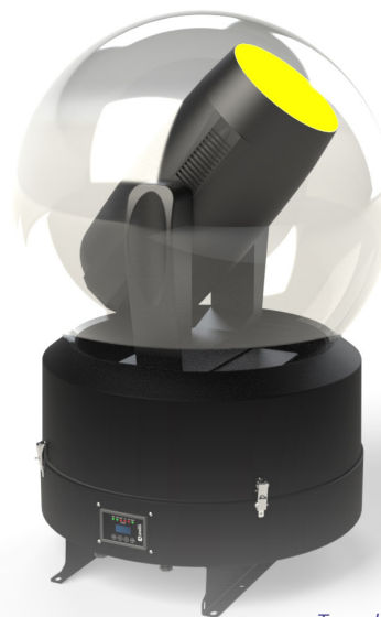
Tornado G4 2300, for most popular 1200-1700W Luminaires