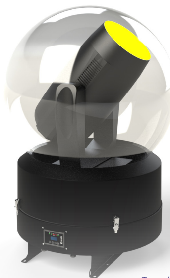
Tornado G4 2300, for most popular 1200-1700W Luminaires