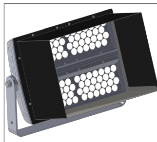
4715.HH High Hat

These Accessories now mount directly onto the face of the fixture, with or without beam-shaping lenses and lens gaskets in place. There is no longer any need for an Accessory Holder.