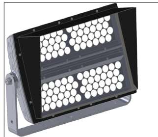
4720.HH Half Hat